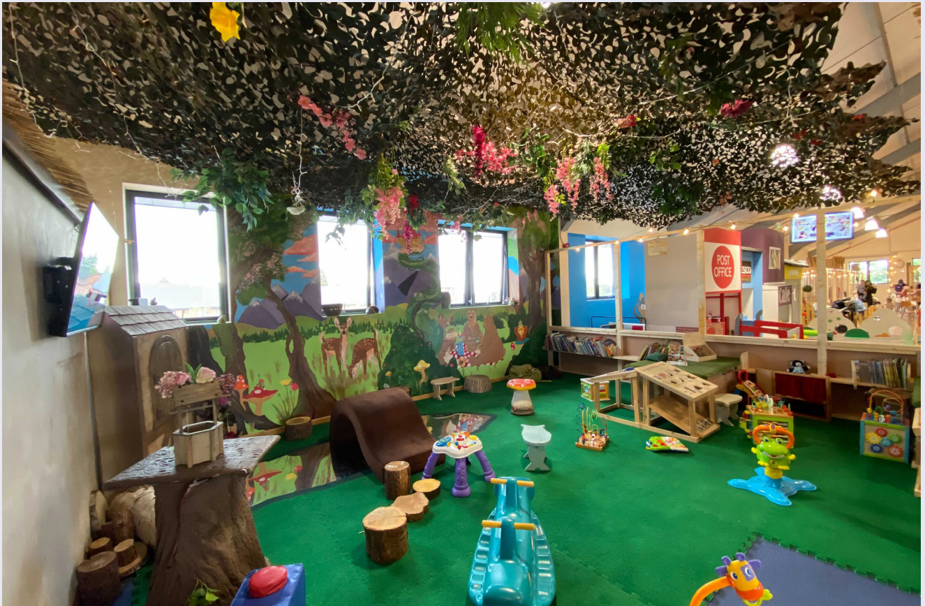
I can play in Woodland Area.