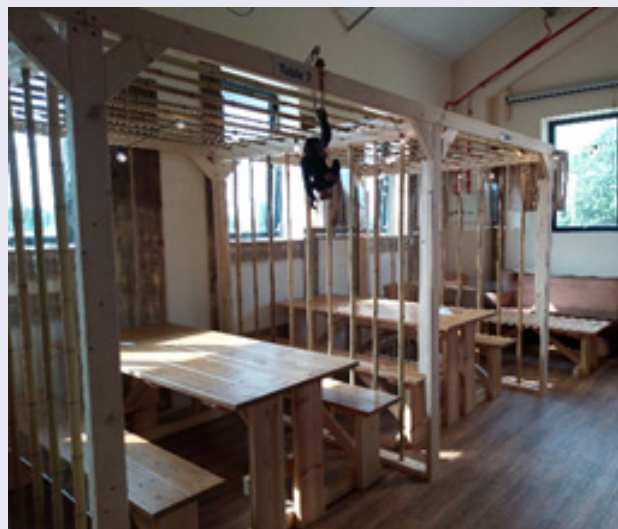
There is a café where I can have a drink and some food.