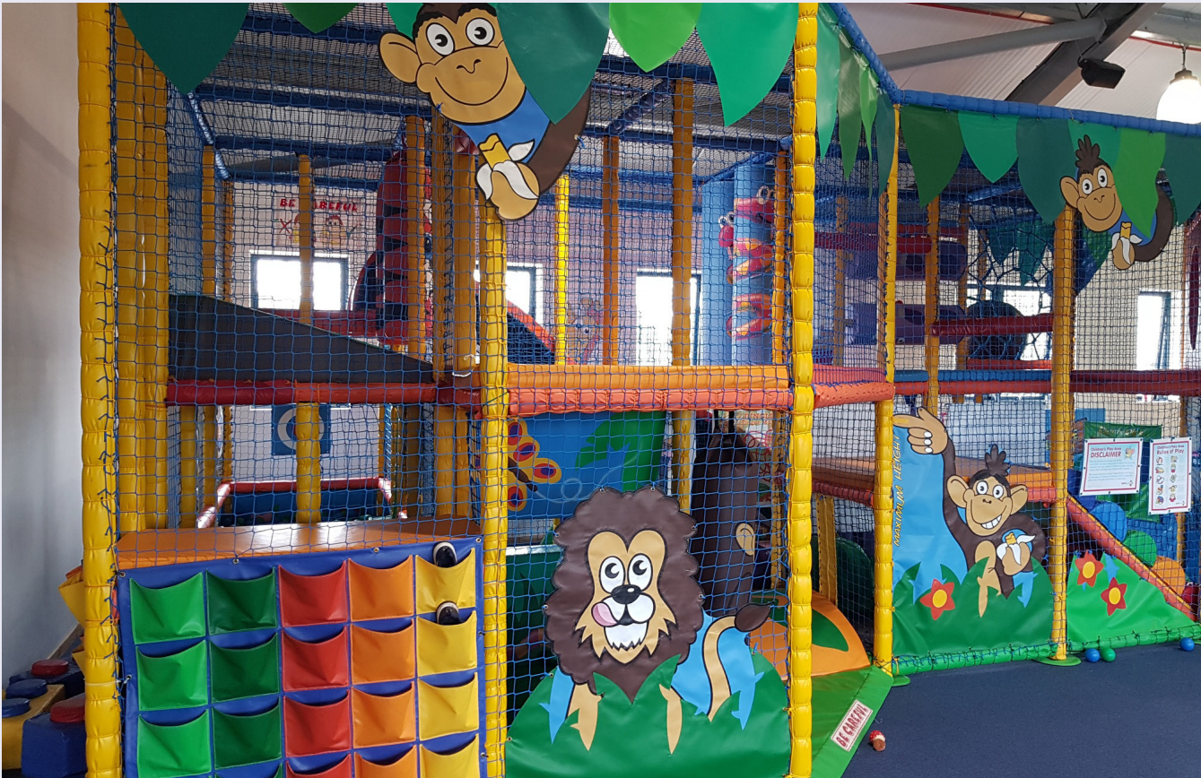
I can play in the Soft Play.