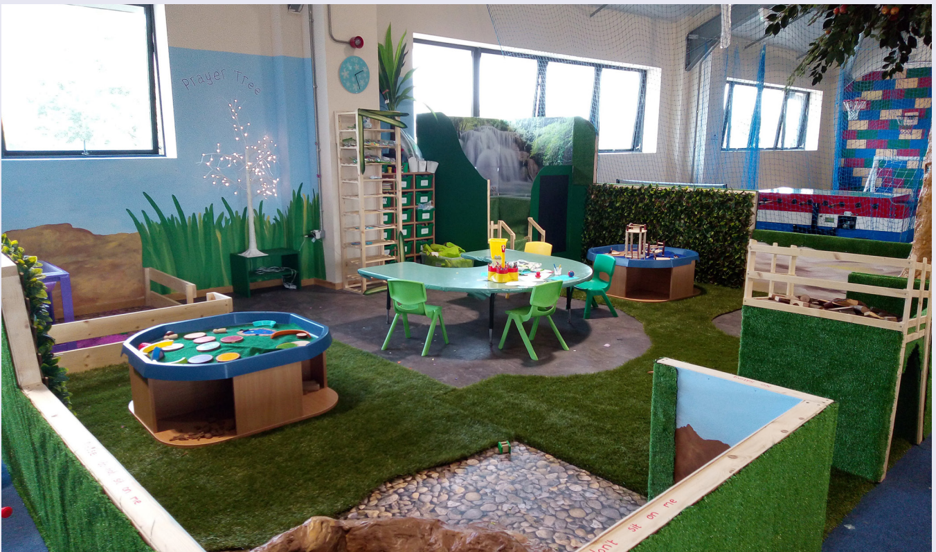
I can play in the Craft Area.