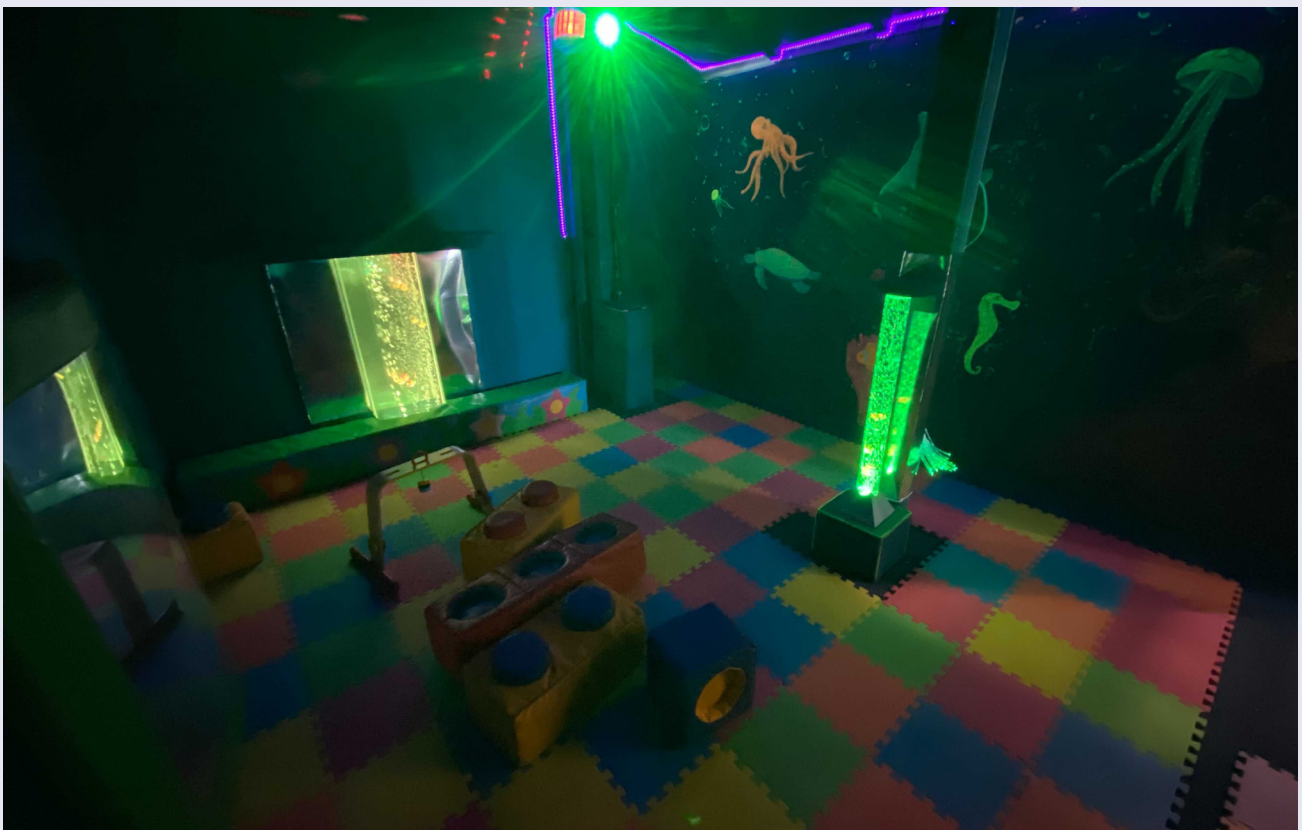
I can play in the Sensory Room.