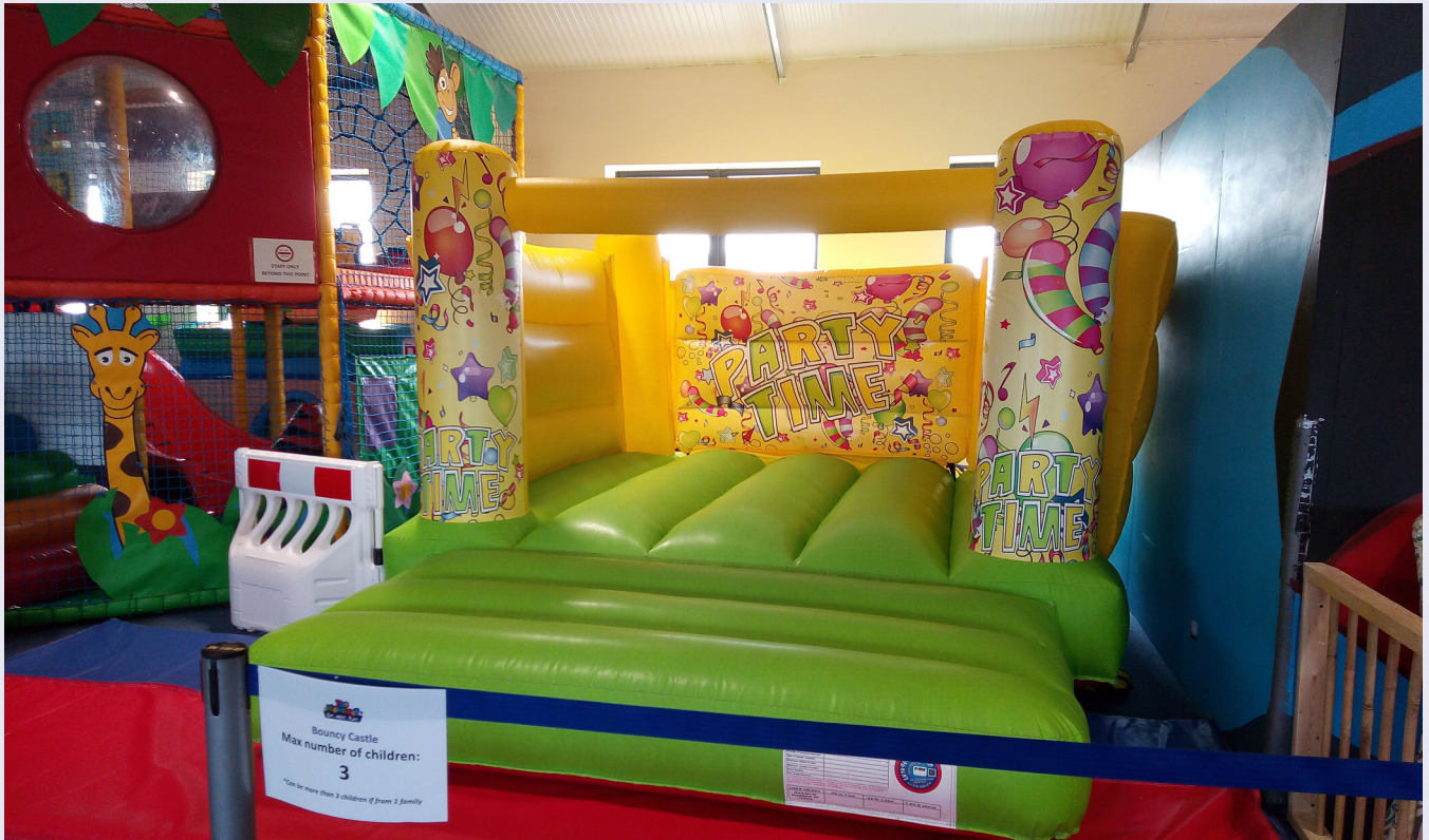
I can play on the Bouncy Castle.